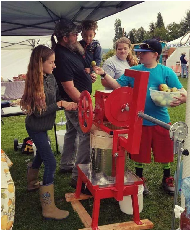
September 28 th - Apple Cider Pressing!