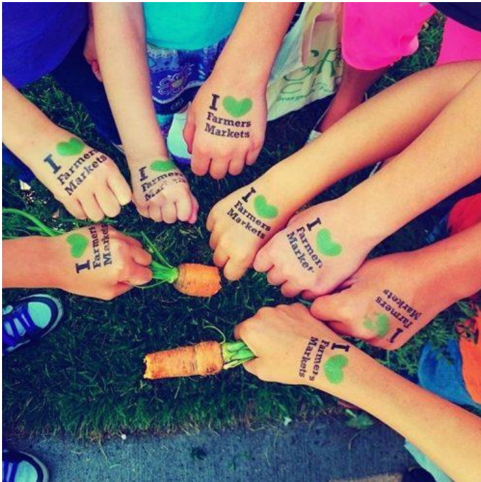
National Farmers Market Week Aug. 4-10 th